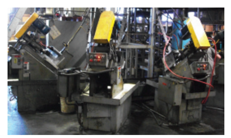
Nut-tapping cells in Unistrut's Wayne, MI, facility function in an environment that is cleaner, safer, and greener after 85% reduction of oil usage in all operations.

I'm really pleased with the results," Bradley says. For tooling, documented benefits include 30% longer tap life. Punches on the press line remain cool as opposed to getting hot when using the straight oil.