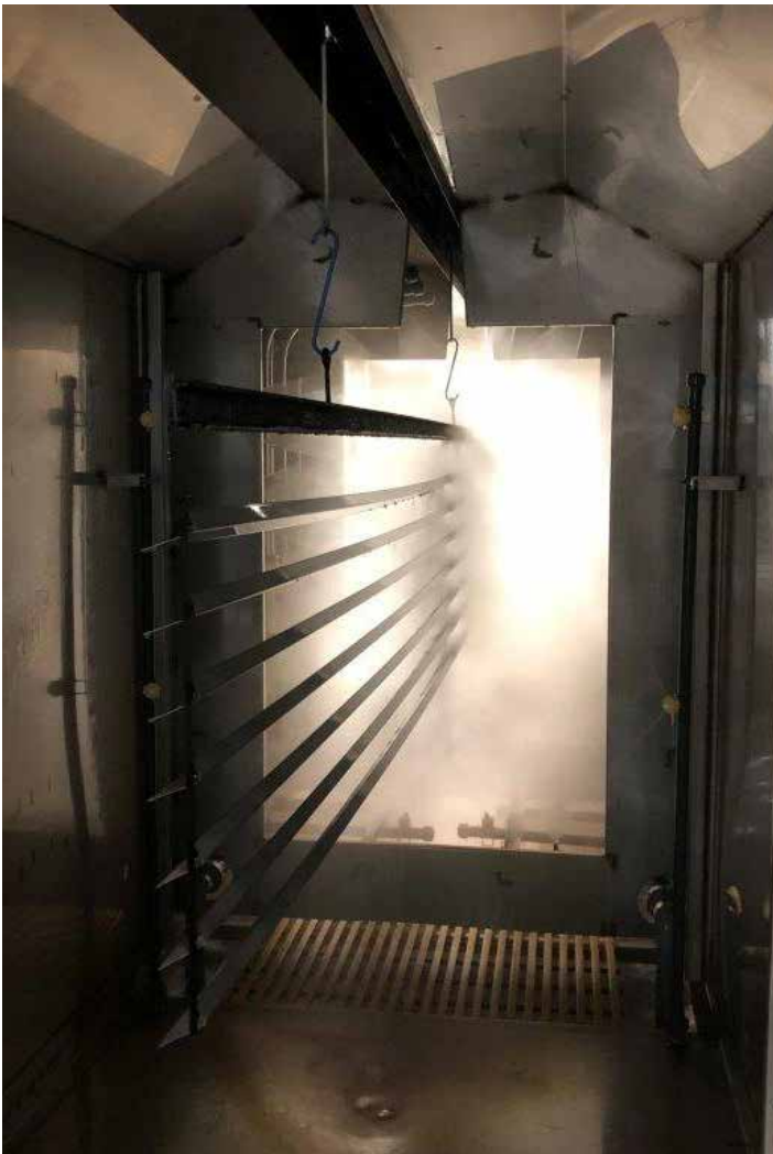
Parts entering one of (2) 7-stage washers to be cleaned and treated with Gardobond A 4002.

The two 7-stage powder coat lines are the specific processes that benefitted from this recent technology upgrade. Powder coating line #1 process includes alkaline cleaning with Gardoclean® TP 10367 and laser-scale removal with a Chemetall acid pickle with Gardacid® P 4462/1 , followed by the iron phosphate technology finish Gardobond A 4002 . The smooth transition to Gardobond A 4002 on the powder coating line #1 was successfully completed in February 2019. The next milestone at Ad-Tech, was the conversion of the powder coating line #2 which was transitioned to Gardobond A 4002 in May of 2020.