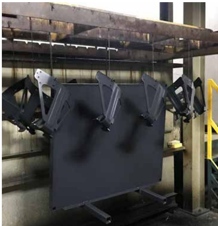
E-coat complete and ready for curing.

Ad-Tech is a successful longstanding supplier to the Agricultural, Construction, and Earthmoving (ACE) industries with clients including John Deere and Caterpillar. In this market there is a need for well-built processes with uniform high-performance iron phosphate coatings. The Gardobond A 4002 technology outperforms other industry solutions, ensuring that coating weights and subsequent paint performance are met consistently and effortlessly.