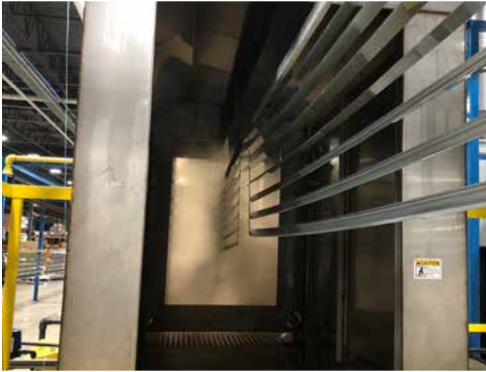
Parts entering one of (2) 7-stage washers to be cleaned and treated with Gardobond A 4002.

Cut it. Clean it. Coat it. Control it. Conserve it.® with us!