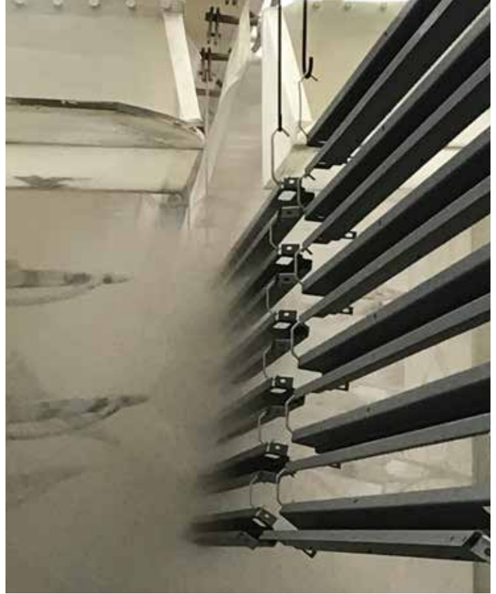
Powder coating in progress.

Chemetall is known for their expertise and dedication to their customers. This is a perfect example of how customers can thrive by receiving new technologies. Chemetall understood Ad-Tech's need for continuous improvement, and its goal to remain sustainable into the future by reducing energy consumption, improving environmental stewardship, and quality.