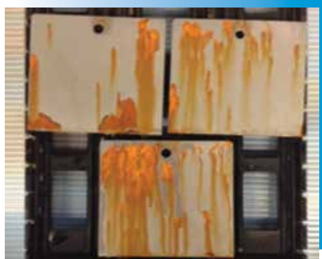
Competition solvent wax RP