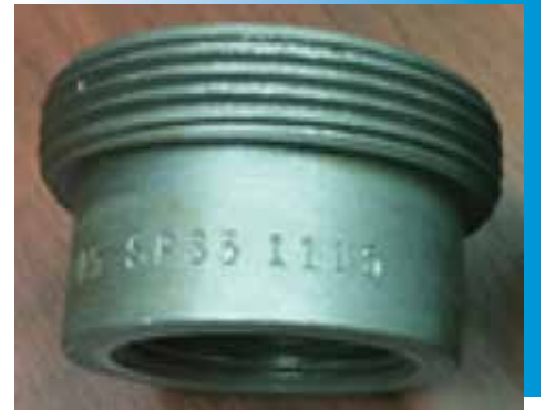
Gardoral CP 8019 – 96 hours