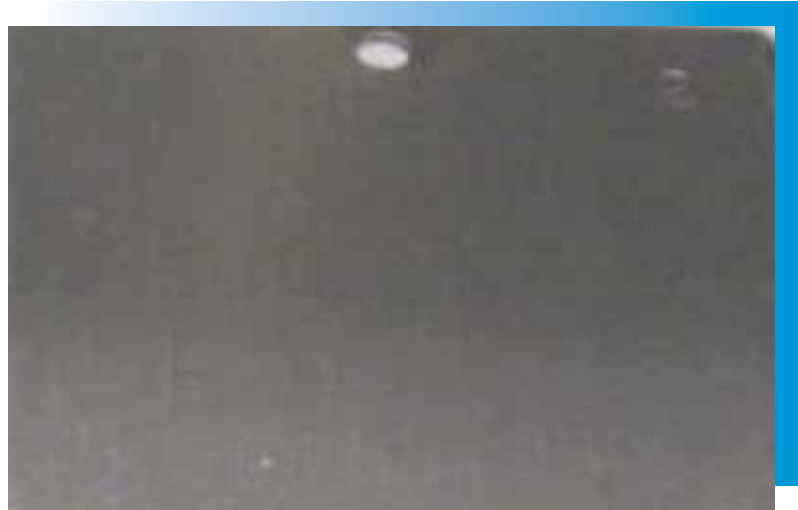
Gardorol CP 8019