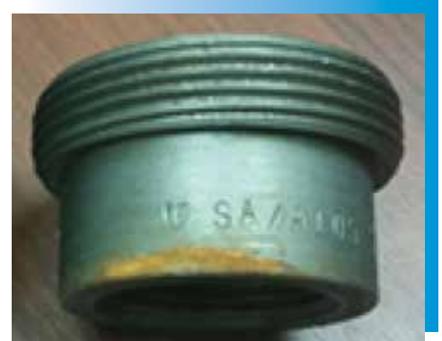
Competition high performance soluble oil RP – 24 hours

Cut it. Clean it. Coat it. Control it. Conserve it.