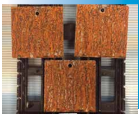
Competition Oil-based RP