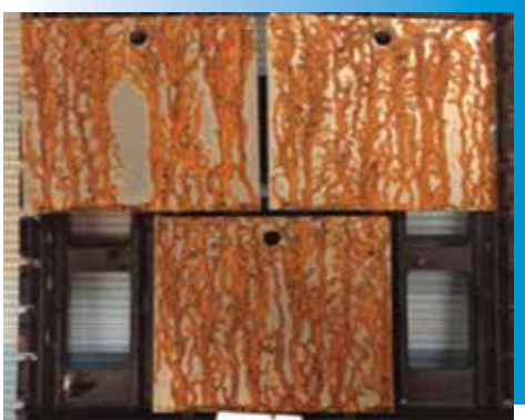
Competition solvent oil barium RP